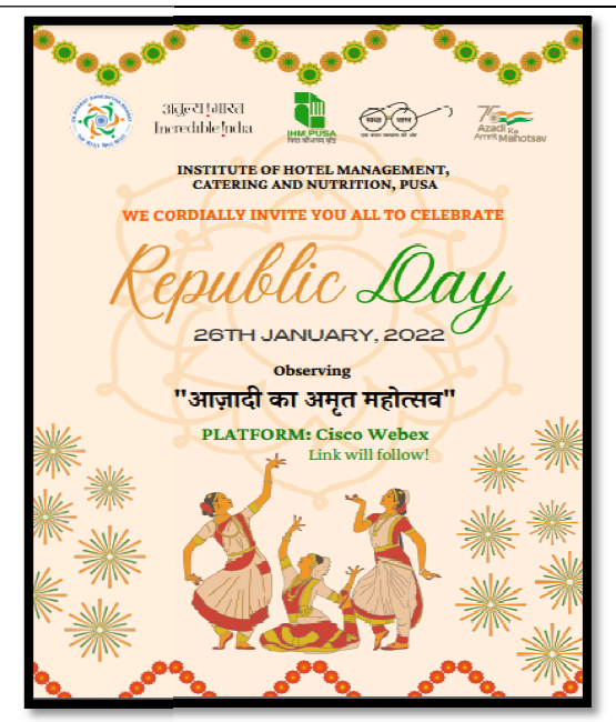
Poster of the Celebrations of 73<sup>rd</sup> Republic Day, 2022 organised by Institute of Hotel Management, Pusa on 26 January, 2022.